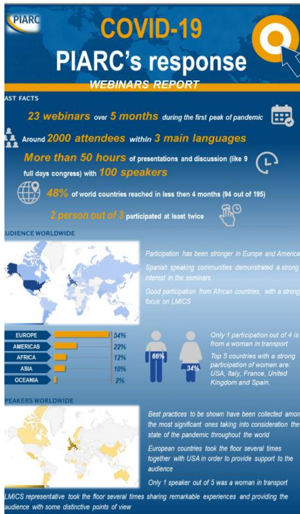
Figure 1: Summary of PIARC COVID-19 Webinar Activities