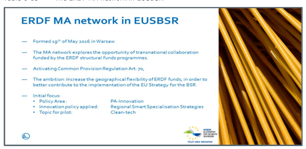
Table 6-13 The ERDF MA network in EUSBSR<sup>120</sup>